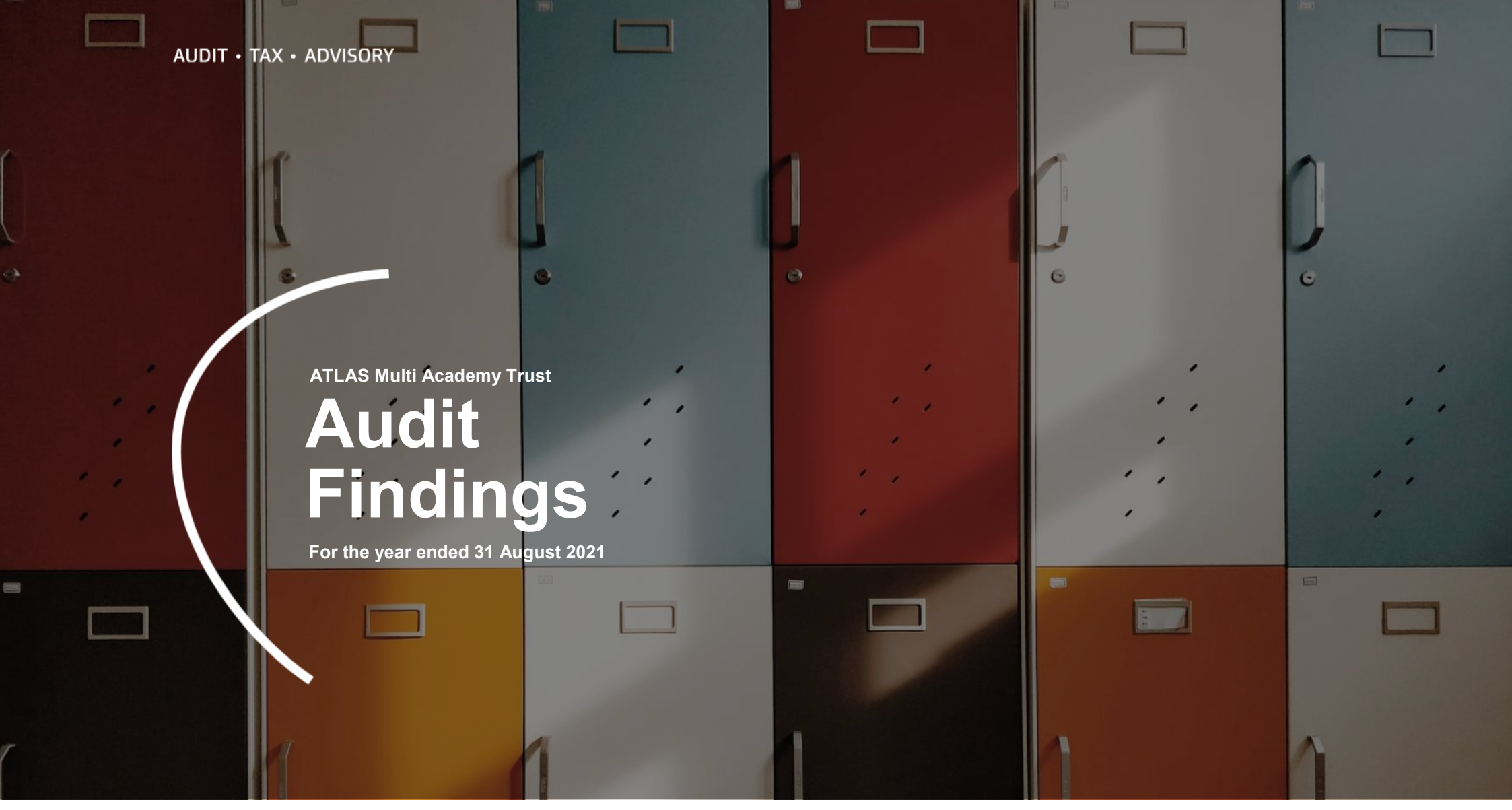
Presented to the Trustees on 1 December 2021